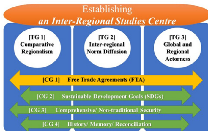
Conceptual Diagram of the Project

The 2019 EU-Japan Forum is one of the project's major activities. The Forum is not an end unto itself, but rather the beginning of a pluri-annual joint research effort. As such, over the course of the Forum's various sessions – 8 topical academic panels, 2 PhD workshops, 1 Public Key-Note and 1 Policy Round-Table – the organizers hope to jump start more substantial research collaboration which is to lead to a series of joint publications such as edited volumes, journal special issues and/or co-authored articles.